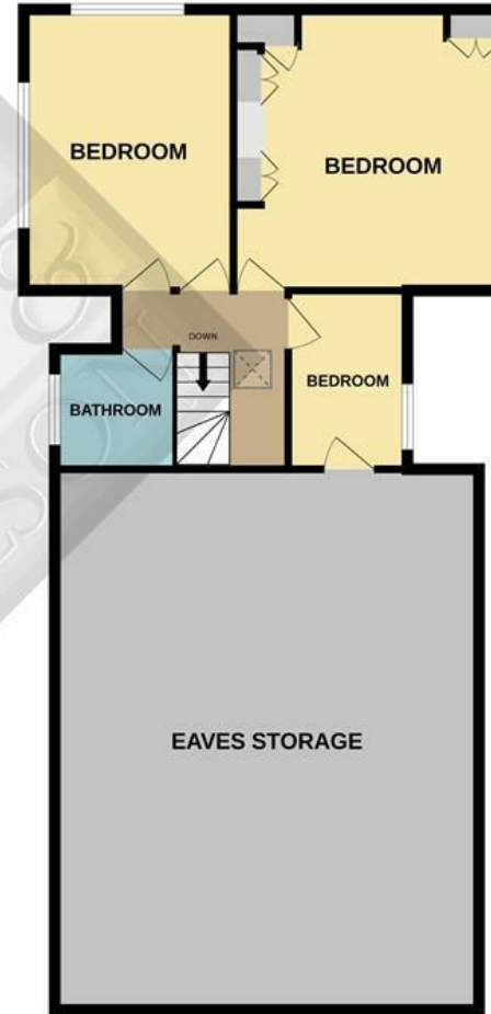
TOTAL FLOOR AREA : 2692 sq.ft. (250.1 sq.m.) approx.

Whilst every attempt has been made to ensure the accuracy of the floorplan contained here, measurements of doors, windows, rooms and any other items are approximate and no responsibility is taken for any error, omission or mis-statement. This plan is for illustrative purposes only and should be used as such by any prospective purchaser. The services, systems and appliances shown have not been tested and no guarantee as to their operability or efficiency can be given. Made with Metropix ©2023